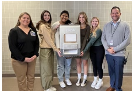
Students and administrators at Palisade High School prepare to install stocked dispensers donated by St. Mary's Medical Center that will provide free period products for students.

St. Mary's Medical Center champions community partners who are addressing critical healthcare needs in their corner of Colorado. One recent project was spearheaded by four incredible young women from Palisade High School who wanted to ensure their fellow students could access feminine hygiene products with dignity, and asked St. Mary's for support.