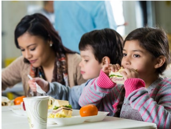
Lutheran Medical Center has found a recipe for success by screening patients to identify individuals who don't have access to healthy and adequate food and then connecting them to community partners who provide home deliveries until patients can independently access long-term resources and support.

As Lutheran Medical Center advances our community health efforts, we are moving upstream to prevent the most prevalent health issues in our communities and not only treat health issues after they occur. This is illustrated by our efforts to address nutrition security, or the ability to access sufficient, quality food, considered foundational to other medical efforts to improve an individual's health.