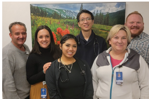
Platte Valley Medical Group-Reunion Family Medicine staff are adding integrated behavioral health care within their primary care practice to increase access to care and reduce stigma.