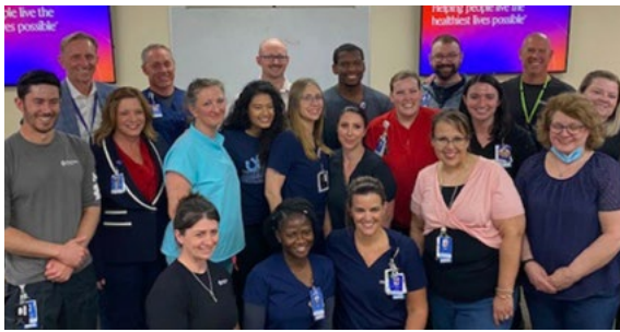
The first cohort from the nursing residency program pictured with leadership from Platte Valley Medical Center and Intermountain Health

In 2021, Platte Valley Medical Center developed a nurse residency program to address nursing shortages and retention. Nursing students at local schools of nursing are encouraged to apply for this competitive 18-month program. There are four phases to the residency program which gives the students access to additional mentorship and support as they complete nursing school and move into their careers.