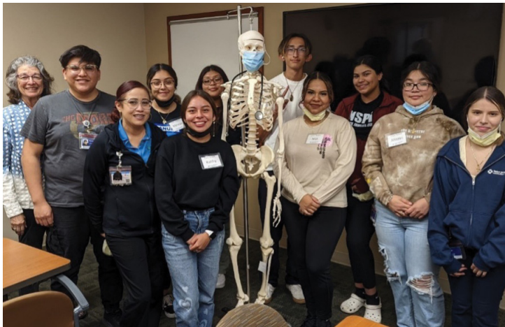
High school students from Manual and West high schools in Denver are completing Certified Nurse Assistant training at Saint Joseph Hospital, readying them for careers in health care.

Following completion of their training hours, they can sit for the Certification exam and begin working at Saint Joseph or other medical provider locations as fully-certified nurse assistants.