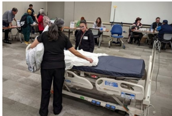
A Project SEARCH candidate learns bed making skills from a Saint Joseph's caregiver.

Additionally, Saint Joseph launched a collaboration with Project SEARCH to provide job training to intellectually and developmentally disabled young adults from the Denver Public School System. The program aims to prepare the students for competitive, entry-level employment through work and life-skills training. Six students are currently training at the hospital.